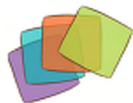
colored film & tissue